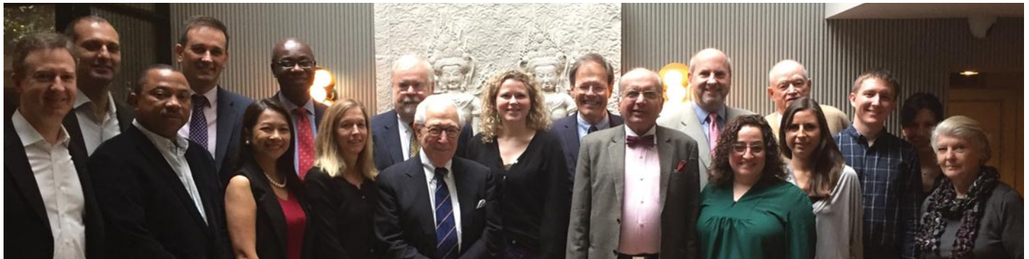
IJGO Editorial Board meeting 2017

2016 was a year filled with exciting developments for IJGO, the official publication of FIGO. In a major change, IJGO announced in July that, from 2017, it would have a new publishing partner and would begin working with Wiley. Work began in earnest on the transition, which has involved an exciting reader-friendly update to the layout of all IJGO articles, a new website within Wiley's