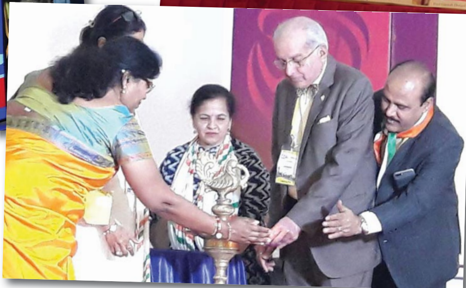
Receiving the AICOG 'Lifetime Achievement' award