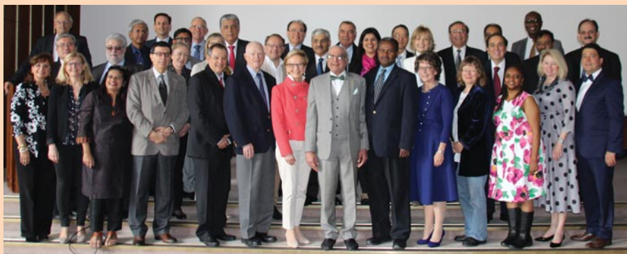
Executive Board 2017

'Additionally, I would like to convey my sincere thanks to the College for its superb organisation and hospitality – I know it was greatly appreciated by our global family.'