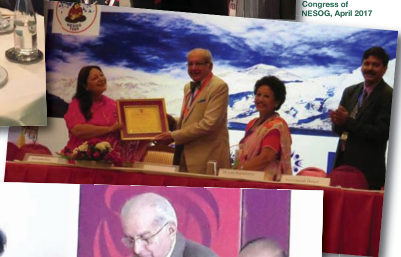
Chief Guest at the 13th National Congress of NESOG, April 2017