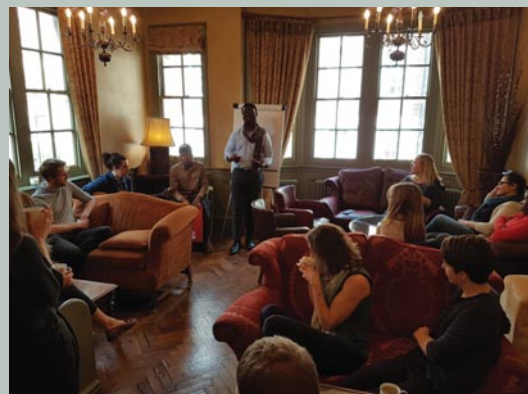
Staff enjoying a musical interlude between course segments

On 30 March 2017, FIGO staff members were treated to a unique training experience, held offsite in London – with much audience participation! – to help them 'understand the key cultural challenges of the cultures represented by their colleagues and clients, and develop intercultural skills to build more effective business relationships across cultural boundaries'.