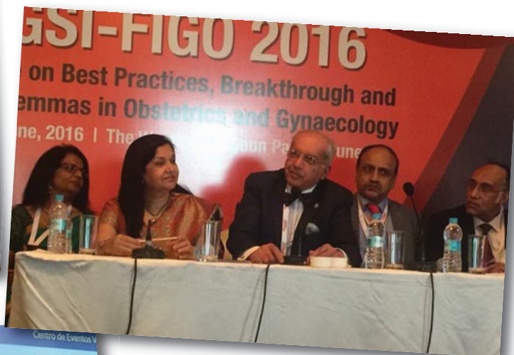
In discussion at FOGSI-FIGO, Pune (June 2016)