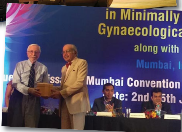
Chief Guest in Mumbai (June 2016)