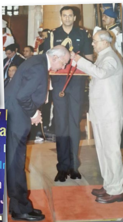
Being presented with the B C Roy award (July 2016)