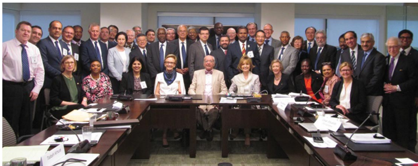
The FIGO Executive Board meeting in Washington, USA (May 2016)