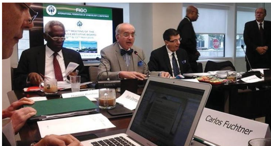
FIGO Executive Board meeting, Washington (May 2016)