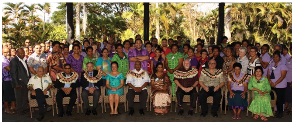
The FOGS Scientific Conference, 10 August 2014

FOGS has worked with the Fiji Ministry of Health and its Clinical Services network to improve the provision of women's health in both tertiary and district hospitals. This has led to contributions to cervical cancer screening programmes, and improvements in the delivery of intrapartum care. Another area of collaboration has been in strengthening both undergraduate and postgraduate training in obstetrics and